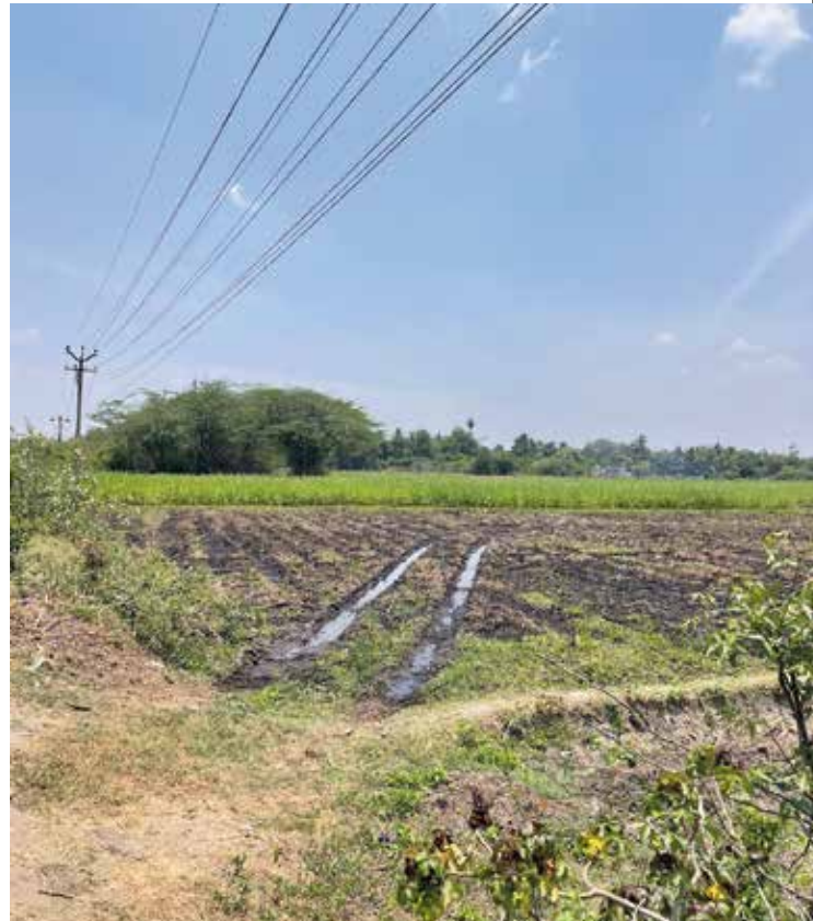
Figure 4: Water that is used to irrigate the fields and is the cause of people's skin disease as they walk on the field.

In Vadakku Vellur, (April 2023) there was one such stream which reportedly was carrying water from Neyveli TPS II and Neyveli New TPS. As per the local people, this water flows to the Moopeneri lake and the water from here is used for irrigation. As per them, earlier 96 acres of this lake was accessible by the people, but now the accessible part has reduced to merely 1-2 acres. They informed the team that the water is now so polluted that not even insects can survive in it. The cattle also do not drink this water. Even the yield from fields irrigated with this water has reduced to a great extent and the food made from this yield tastes sour. When people sell this yield, they reportedly now fetch Rs. 300-350 less for a sack of rice than what they used to get. They report that they don't consume their produce themselves and have to purchase it from elsewhere. They said more than half the people have skin issues because they have to walk in the polluted water laden fields (Figure 4). It is not even easy to extract groundwater, as the water levels have gone down to 700-800 ft. Water testing from the stream done as part of this study (Location R2 S3) reveals high turbidity and elevated Selenium levels.