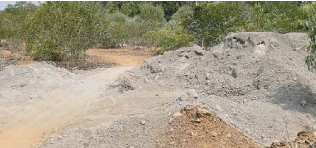
Figure 13: Ash dumped just outside of Neyveli II TPS.