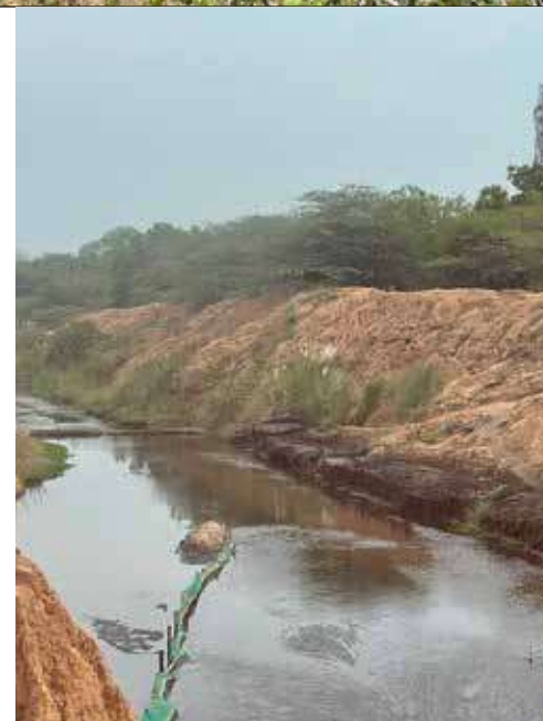
Figure 6: Small bunds created by the villagers to arrest lignite further down the same stream.

The team saw another stream which local people informed as originating from the Neyveli TPS I EXP. As informed, this water like other streams carrying water from other TPSs carries lignite washed water, boiler water and water from the coal stockyard of the TPS (Figure 5). A little further down the stream small bunds were seen, as locals informed, people have constructed these bunds to arrest the lignite particles mixed in the water. After collection, the local people sell this lignite (Figure 6). The stream meets the Walajah lake. Water sampling of this stream (Location R2 S7) revealed heavy contamination with high turbidity, hardness, Calcium, Magnesium and Selenium levels.