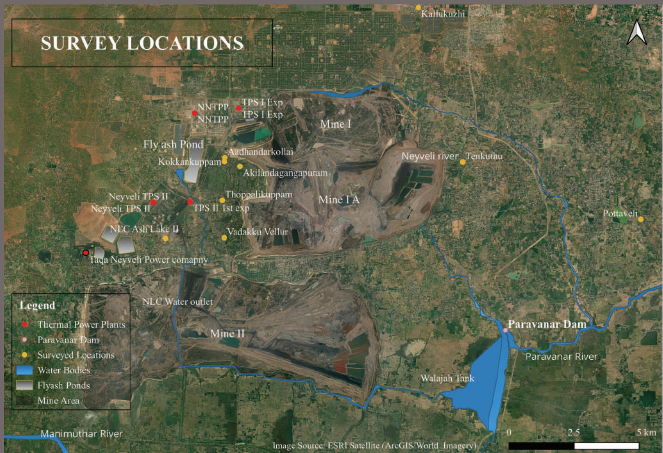
Figure 2: Villages where questionnaire survey and FoGD was conducted