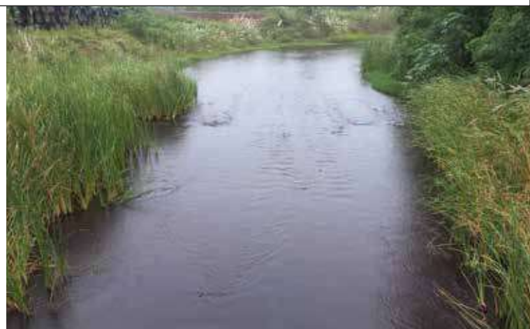
Figure 9: Stream carrying discharge from all TPS.

The study team noted a stream carrying discharge that was dark black in colour at yet another location. The team was informed by reliable sources that this stream is carrying discharge from several of the power plants coming together (Figure 9). The water from this point was sampled and tested in both the rounds of water testing (R1-L5 and R2 -S2) and was found to be seriously contaminated with high TSS in violation of limits, and presence of Mercury, Selenium, Fluoride, Iron, Magnesium, Silicon, Aluminium in high concentrations.