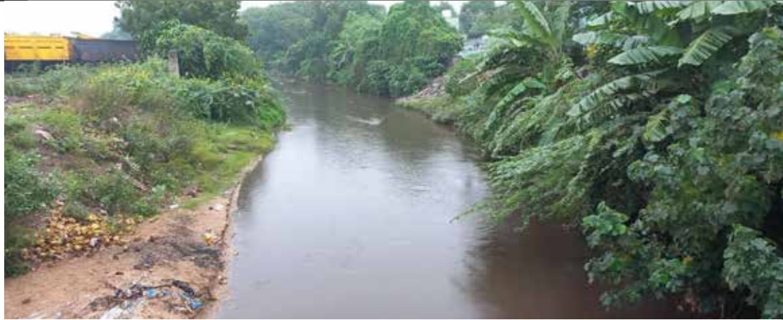
Figure 10: Polluted stream opposite Mine II gate.

The team visited a location in front of the gate of Mine 2, where it saw a highly polluted stream which the team was informed by reliable sources was carrying discharge from the mine 2 (Figure 10).