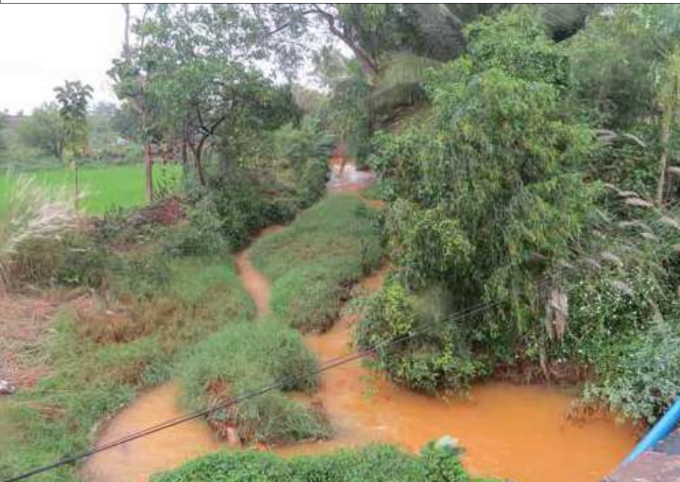
Figure 11: Brown-Yellow colour of the discharge stream from Mine 1 and 1A.

At another location where a discharge stream from Mine IA was observed, the team was informed that some discharge from Mine I is also mixed with this. The colour of the stream was yellow-brown which could indicate either high silt, but could also be indicative of acidic mine water discharge (Figure 11). As informed by the locals, this goes all the way to the Bay of Bengal. Water samples some distance downstream from this point had been collected for testing (R2 - S 1), and the test results showed the water to be uncontaminated. However, the sampling was done a few months after this field observation had been made. A more regular sampling and testing of this discharge is recommended.