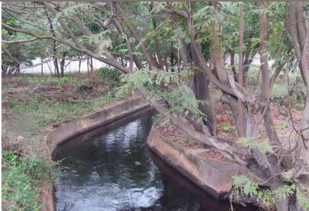
Figure 7: Effluent directly discharged from NLC TPS II with plant boundary visible in the background.

In the visit made in December 2022, the study team observed a stream with heavily polluted water coming straight out of Neyveli TPS II premises. The water was dark and had oil floating on it. TPS II plant boundary wall was observed in the background of the stream (Figure 7). The fact that it is channelized also indicates that it is designed and intended as an effluent channel. This water is being discharged directly into the environment.