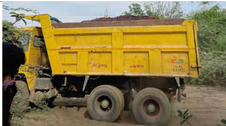
Figure 15: Uncovered trucks carrying the residue to an unidentified location.

While visiting the discharge stream reportedly carrying discharges from TPS II and ash pond of TPS II, a few uncovered trucks were seen carrying a mixture to an unknown location (Figure 15). The local people informed that the trucks were carrying a residue that is left after combustion of lignite for electricity generation. This residue consists of sand, ash and some lignite particles. They informed that the residue is collected, transported and then illegally dumped in some location not exactly known to them.