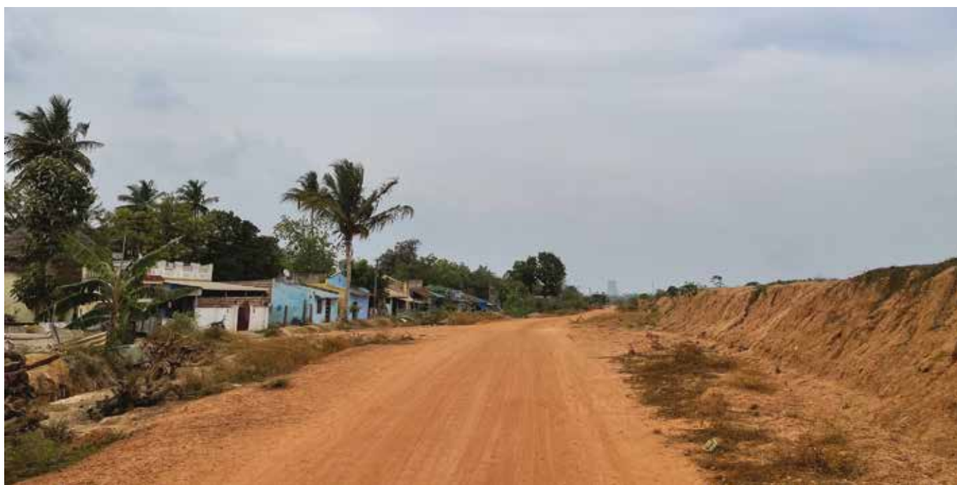
Figure 14: A kutchra road separating the homes of the people and Mine I boundary.

It may be highlighted that the water testing of bore water from this village, used for drinking and domestic use by the people, showed alarmingly high levels of mercury and other pollutants. People also reported several serious ailments that are prevalent in the community here.