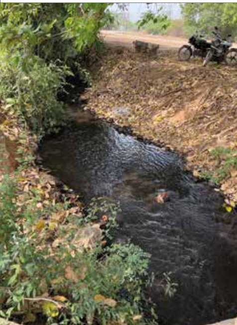
Figure 5: Stream reportedly carrying water from Neyveli TPS I EXP.