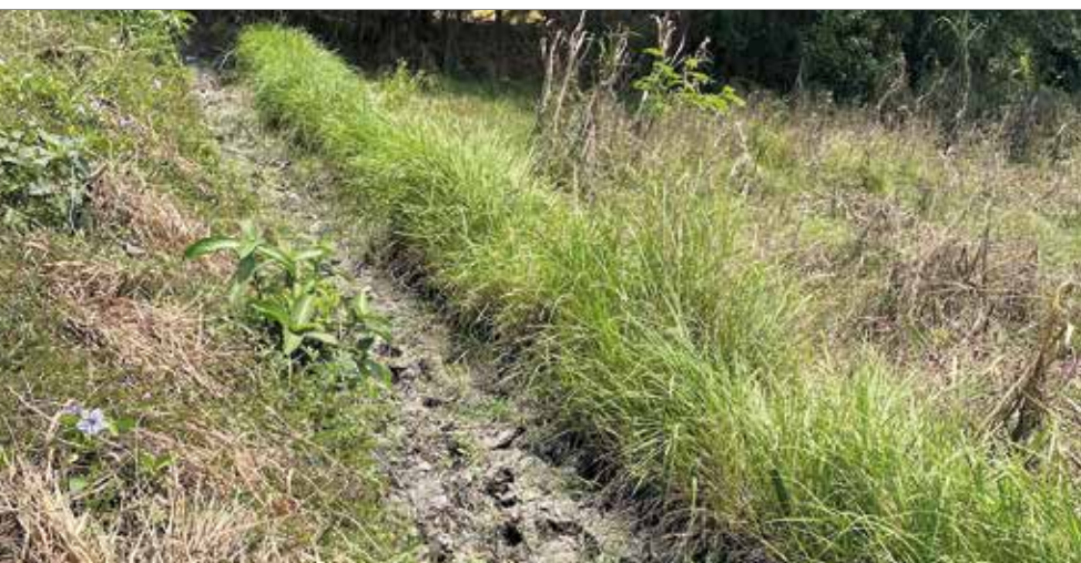
Figure 16: Ash deposits on the field where sugarcane plantation was burnt by the villagers.