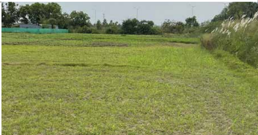
Figure 17: Agricultural patch of land that bore no yield.

Another patch of agricultural land was seen with ash dust in the soil (Figure 17). The locals reported that this agricultural land bore no yield. Soil sampling of this location revealed soil with low pH and serious contamination with high Selenium.