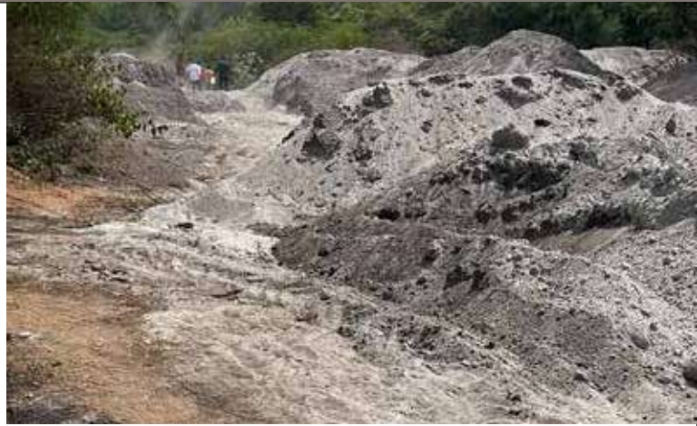
Figure 12: Ash dumped near the central water store.

During the field visit in Neyveli in April 2023, near the central water store where reportedly all the chemical laden, untreated water used to clean all the equipment comes, huge amounts of fly ash was seen dumped on the ground (Figure 12). The local person told the team that it was deposited by Neyveli TPS I EXP.