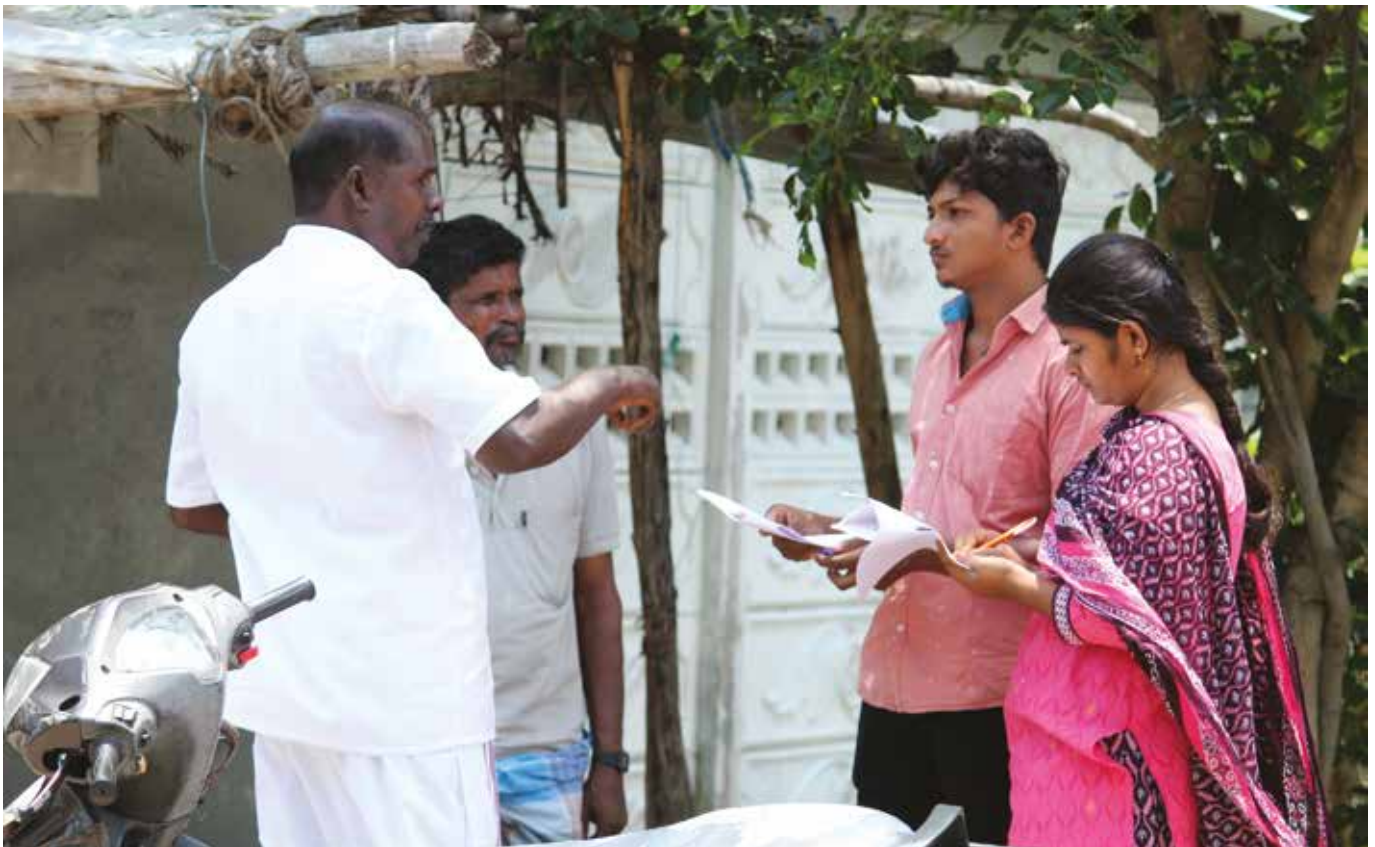
Figure 3: Questionnaire survey being conducted in Adhandarkollai village

for agriculture or it was not sufficient enough to practice agriculture on. Livelihoods are affected. Agriculture practice and jobs have reduced leading to migration of people. Those who have stayed back, their health and farming practices have been adversely affected due to high levels of pollution. It was reported that job promises were given by NLC but were not fulfilled. Either the job was not given to the people or was given on a contractual basis with no health benefits etc.