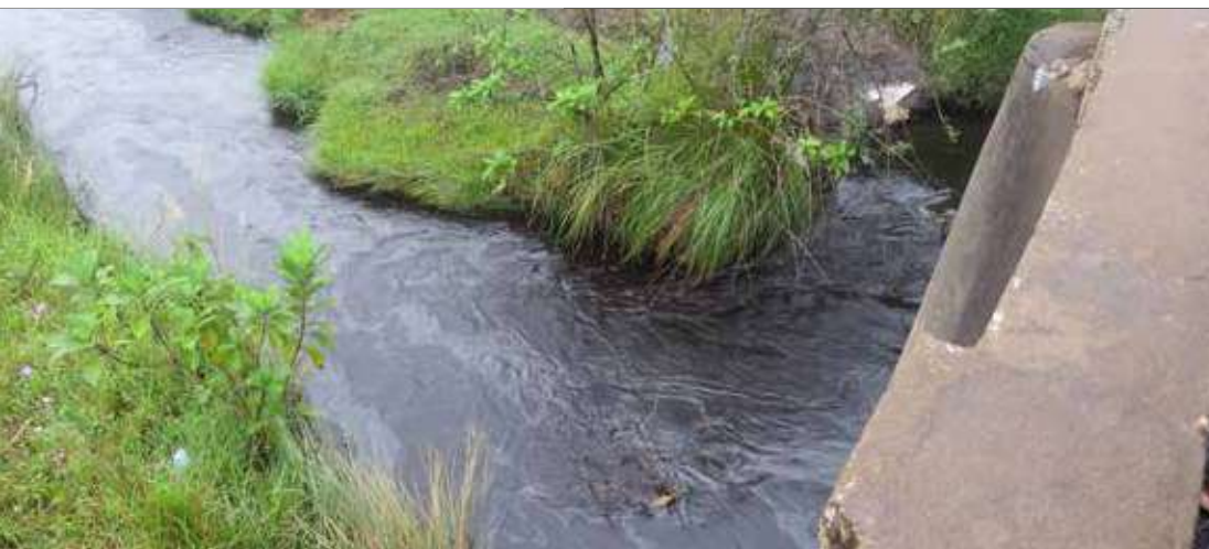
Figure 8: Black colour stream with oil in it.